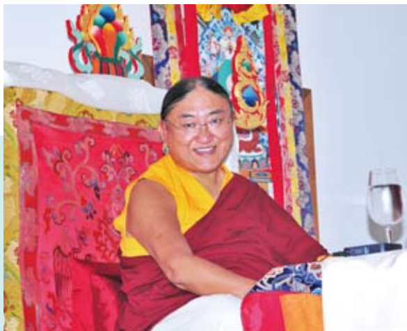
A radiant smile from His Holiness