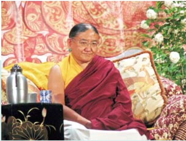
His Holiness giving a public talk in Moscow

a lot of big changes here. He even said as a joke that, compared with His visit to Russia in 1995, now everything looked like a pure land. He said that even as the airplane was approaching Moscow, He and His entourage could see that everything was very green and beautiful, and His Holiness got the impression that prosperity had spontaneously come to our land.