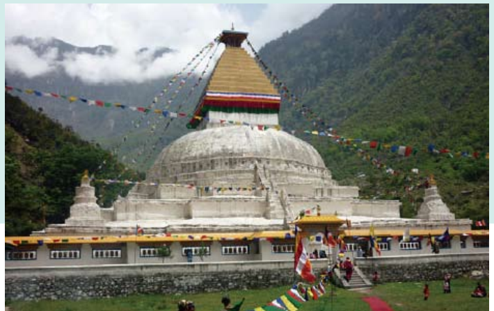
↑ Gorsam Chorten