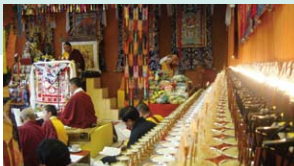
His Holiness performing a Padmasambhava 100,000 Tsok Offering Puja in Rikon, Switzerland

And finally, on Tuesday the 17 th of August, after three months of near ceaseless teaching activity, His Holiness boarded a flight that was to take Him back to India, where He would be reunited with His Family and be able to spend precious time with His grandchildren.