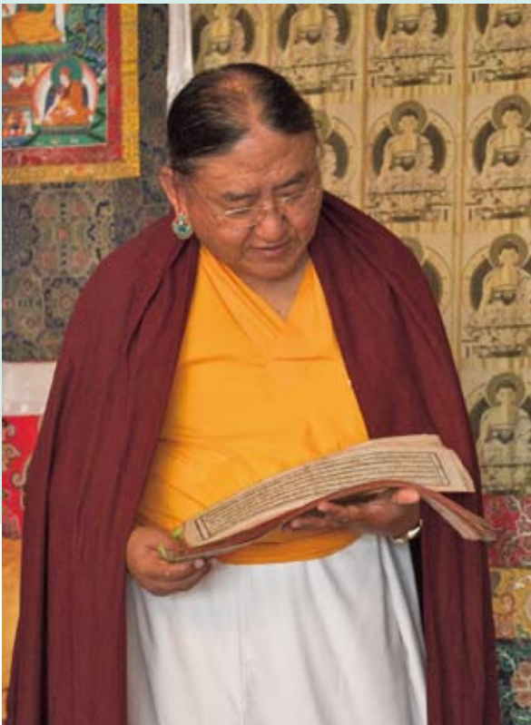
His Holiness peruses a pecha

While at the Institute, His Holiness gave a Buddha Ayuttara initiation to an assembly of over 1500 Tibetans, some of whom had travelled a considerable distance in order to be there.