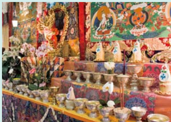
The altar with its precious offerings