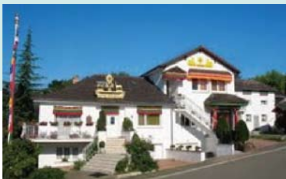
The very beautiful Sakya Tsechen Ling

The members of Sakya Tsechen Ling have always been exceedingly generous in their support of Dharma activities, and have funded several charities in Tibet. Among other things, they were the main sponsors for the making of the superb Shakyamuni statue at the Sakya Centre, His Holiness' main monastery in India.