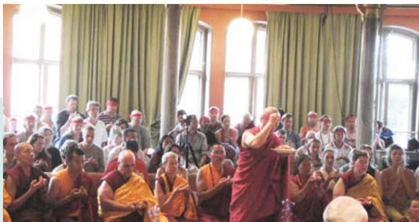
Mandala offering at the Kalacakra wangchen in Stockholm