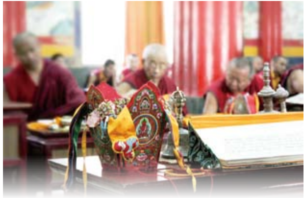
Ceremonial hat at the Mahavairocana puja