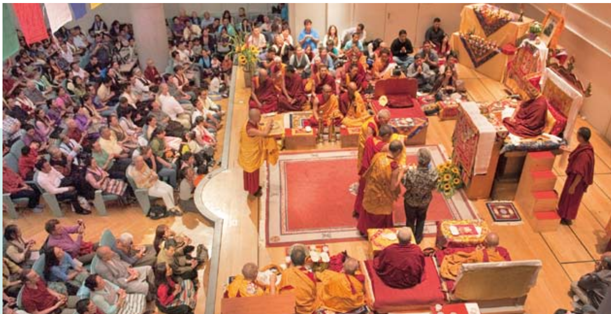
A mandala offering being presented to His Holiness at Rikon