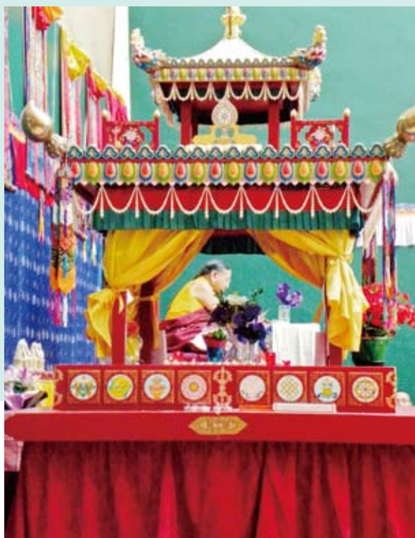
The Kalacakra Mandala House in Biarritz

a gompa was astonishing. The shrine was magnificent, the mandala house breathtaking, and the beauty of the