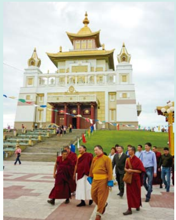
His Holiness, monks and followers at Buddha Shakyamuni Temple in Elista

The temple was filled with devotees as His Holiness imparted teachings and initiations, including a Vajrayogini blessing. He was earnestly beckoned to visit Kalmyk again soon.