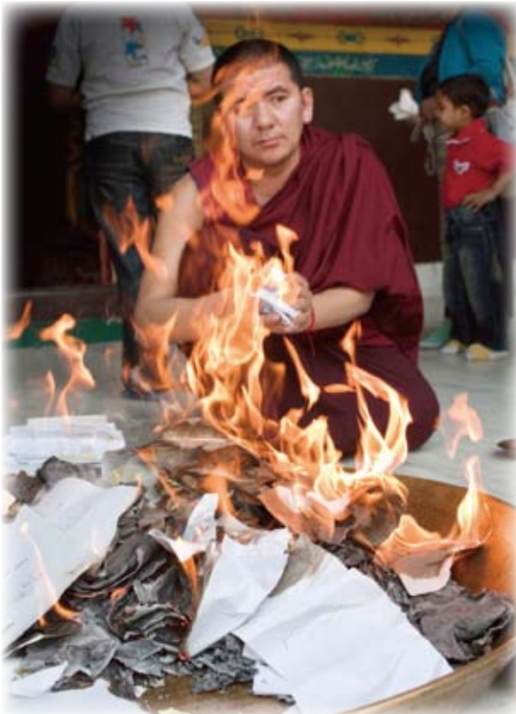
Mahavairocana ritual of purification: lists of names of the deceased are put into the flames

Saravidhia is a very powerful puja and initiation. It is particularly powerful in purifying karma that causes to be born in the lower realms. We usually perform this puja for the deceased. But it is also very beneficial for people who are gravely ill, as it either speeds up their recovery process, or grants them a quick death, saving them from extended suffering.