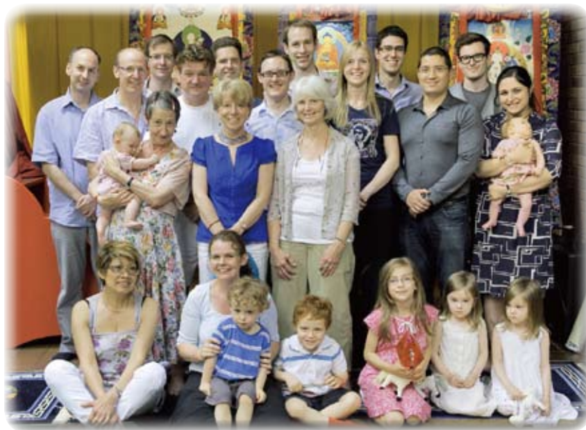
Members of Sakya Dechen Ling, London

Below please find the contact details for His Holiness' Residence and main monasteries in India: