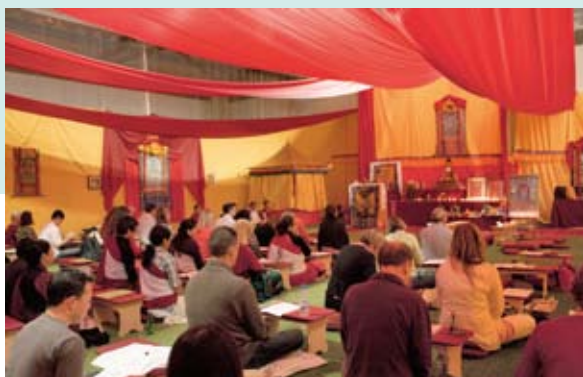
Dorset Cricket Centre transformed into a stunning gompā

On 11 th June, His Holiness travelled to London, where He was to spend the following week. On the afternoon of His arrival, His Holiness was invited by the Tibet Foundation to give a lecture at the SOAS (School of Oriental and African Studies) on “Consciousness from a Tibetan Buddhist Perspective”. That evening, His Holiness was guest speaker at the celebration of the 25 th Anniversary of Tibet Foundation.