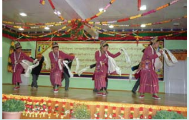
Children performing for His Holiness at a Tawang orphanage

Namgyal Lhatse, commonly known as Tawang Monastery, one of the largest of its kind in the world. It is the wellspring of spiritual life for the people of the region. There, His Holiness gave talks, including one in English, where He stressed the importance of spiritual life. A tenshuk ceremony was held in His Holiness' honour, where people came in their hundreds to pay homage to their Guru.