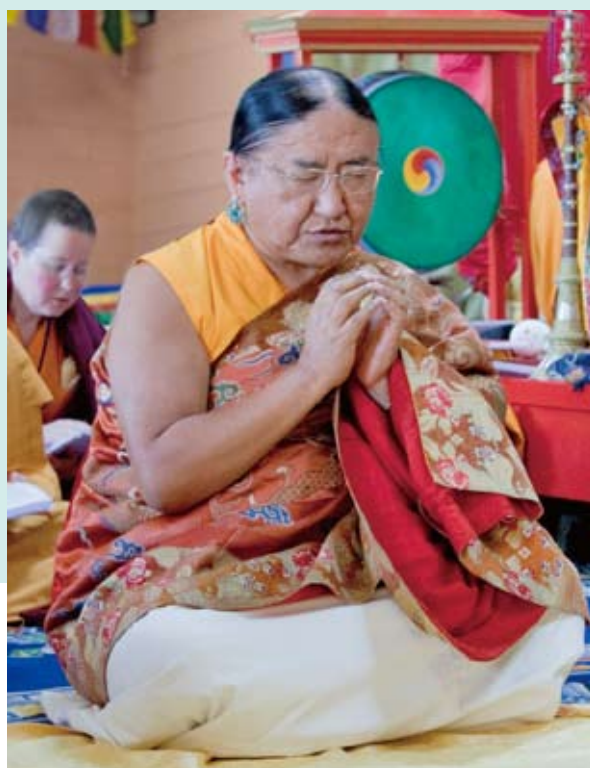
His Holiness leading the Bodhisattva Vows ceremony