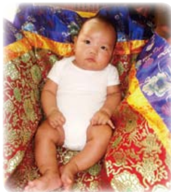
Dungsey Akasha Rinpoche