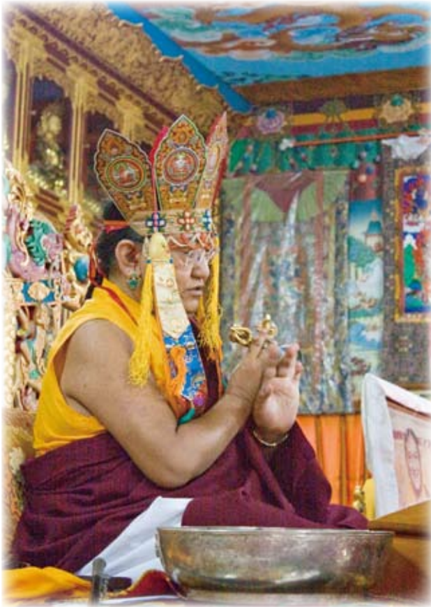
His Holiness officiating at a Mahavairocana puja in Sakya Centre earlier this year

Mahavairocana is one of the most important pujas in Tibetan Buddhism. In Tibetan, it is called ‘Khünrig’, and in Sanskrit ‘Saravidhia’. Originally, it was a tantra given in the heavenly realms.