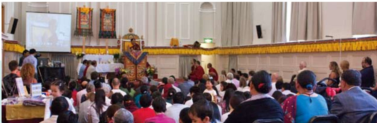
His Holiness teaching the Amitabha Powa in Reading

Immediately following His Holiness' visit, a new Sakya dharma center was opened in Moscow, and we pray that it will grow stronger and stronger; we pray that the Sakya teachings will spread widely in Russia, that many Sakya lamas will visit us in the future, and that the disciples of this center will greatly benefit all sentient beings. Sarwa Mangalam!