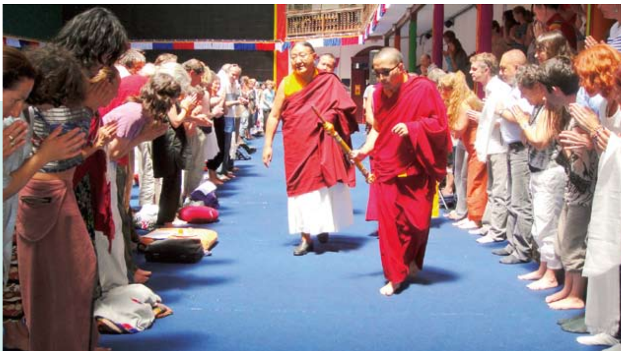
His Holiness arriving at the hall