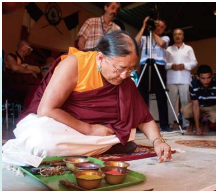
His Holiness initiating the sand mandala