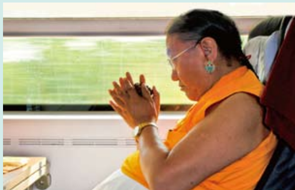
A moment of calm for His Holiness

That evening, His Holiness gave a public talk on the importance of spiritual progress and how to integrate it into everyday life.