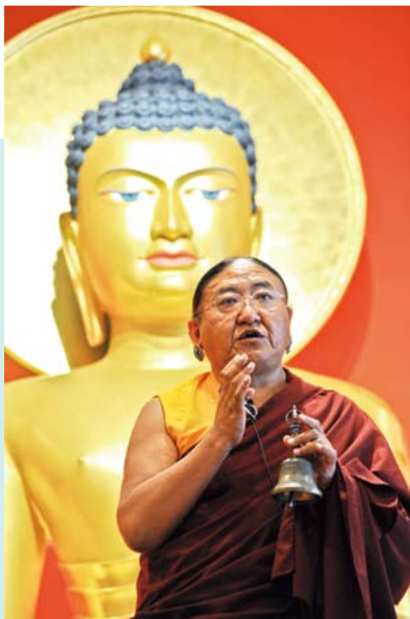
His Holiness at Rigpa-Zentrum, Berlin

His Holiness then spent three days at the Rigpa-Zentrum in Berlin, where He was greeted on 3 rd July with a traditional and warm welcome by keen students awaiting Him in the centre courtyard. That evening, His Holiness gave a teaching on 'The Six Paramitas' to