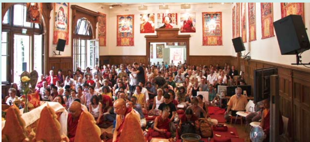
Rigpa-Zentrum, Sogyal Rinpoche's centre in Berlin

On 7 th July, His Holiness travelled to Stockholm, Sweden. There are not many Buddhists in Sweden, and the members of Sakya Changchub Chöling usually meet in a private house. They were overwhelmed