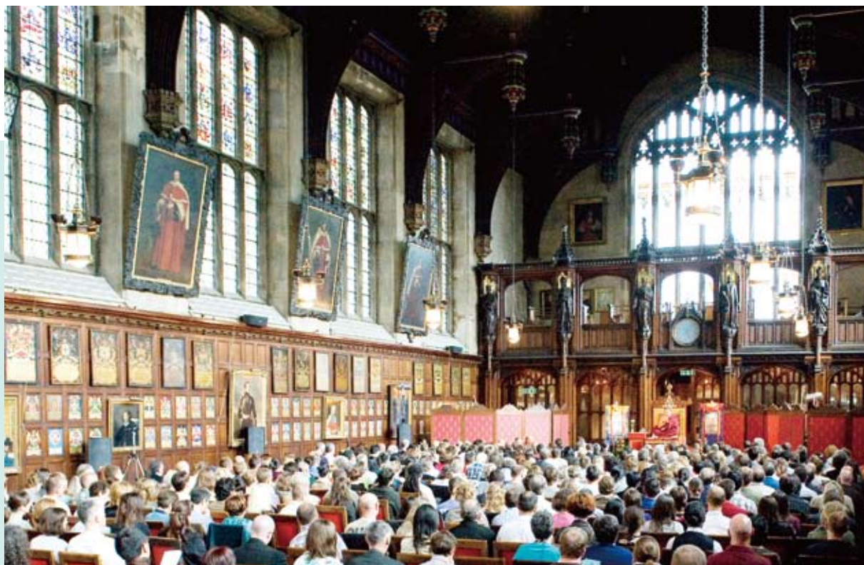
His Holiness teaching at the Great Hall of the Lincoln's Inn, London