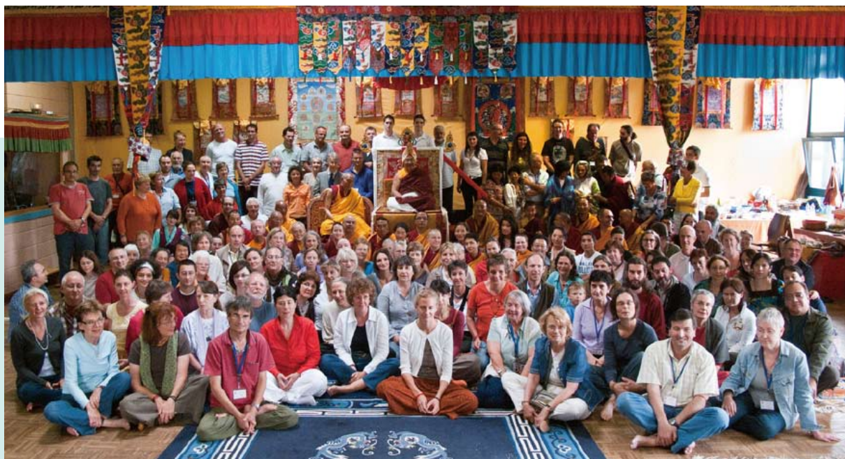
Group photo on the last day of the teachings