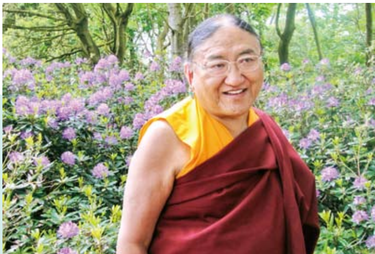
His Holiness enjoying the woods at Deer Park

‘The greatest blessing of my life has been to receive these teachings and empowerments from His Holiness Sakya Trizin. Being with him for an intense four days is akin to having your entire being blown apart, re-wired, and left to settle, and when it