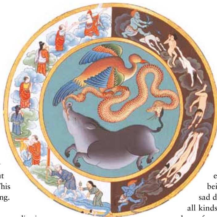
(Detail) The Wheel of Life

able to remain single-pointedly in complete tranquillity without any disturbances or thoughts. This is the attainment of calm abiding.