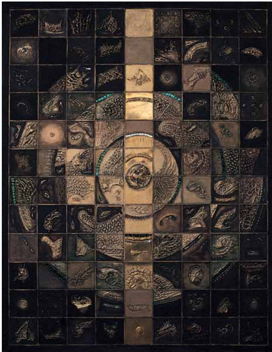
New image of Wheel of Life 7, 1993 by Apichai Piromrak

This story shows that it is not right to seek liberation only for our own purpose. The goal for which we all should aim is full enlightenment for the benefit of all beings. Such enlightenment does not arise without a cause, from an incomplete cause, or from the wrong cause and condition. For example, if we plant a rice seed during the winter, then although the correct seed was planted, still rice will not grow. Likewise, if we plant a wheat seed, rice will not appear. To grow rice, we need a rice seed as well as the proper temperature, moisture, and time. All of the correct causes and conditions must be present for the rice to grow.