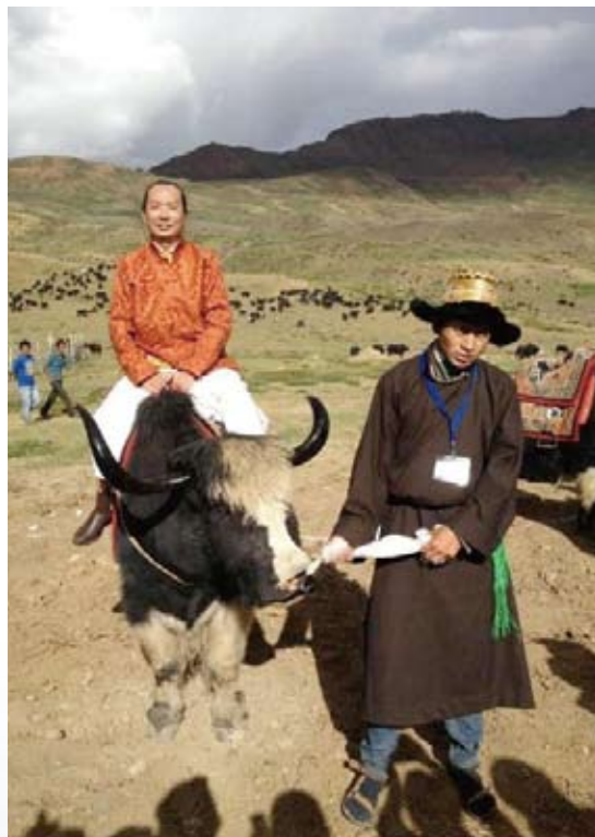
Rinpoche adopts the favoured mode of transport

Rinpoche also took time to visit the Tabo and Kye