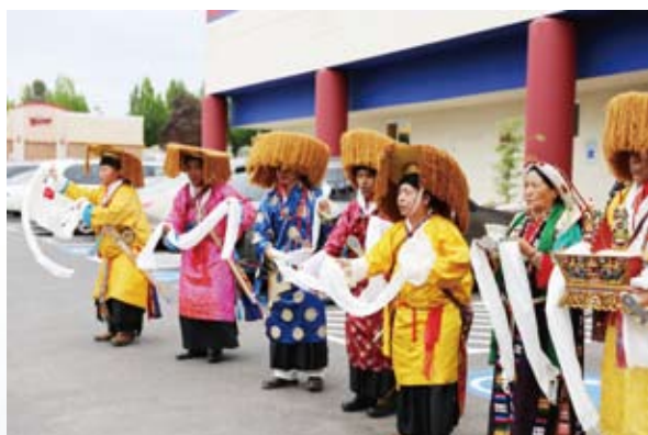
A traditional Tibetan welcome