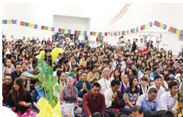
Teaching venue and sangha in San Francisco