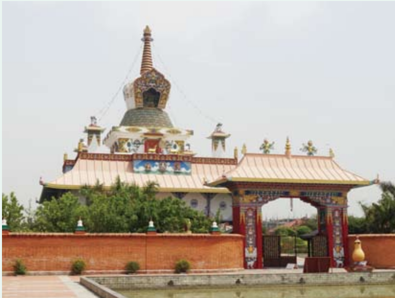
German Vajrayana Temple

thousands of Sakyapa monastics from India and Nepal, local Theravadan monks, and followers from all over the world.