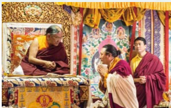
His Holiness at Thekchok Ling