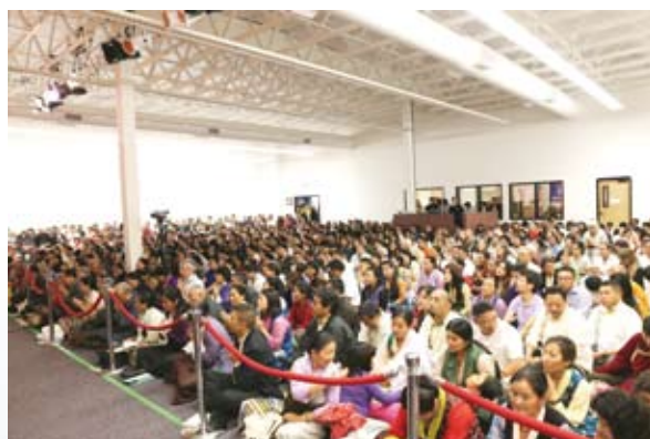
The Tibetan community receiving an initiation in Eugene