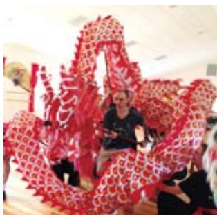
Peaceful Dragon members perform a Dragon Dance and a martial arts demonstration for His Holiness