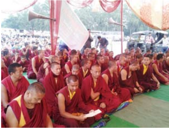
Sakya Centre and Nunnery monks and nuns help in the rescue effort