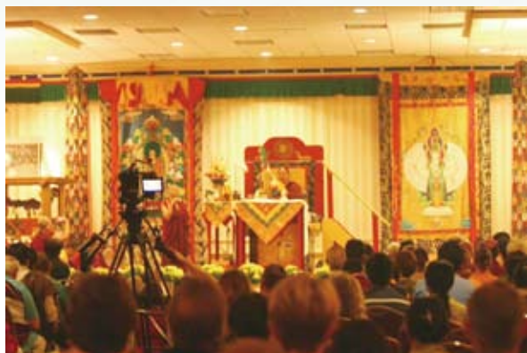
His Holiness in Boston