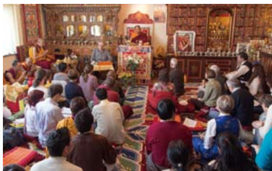
Ushnisha Vijaya initiation

next to the centre. A newly-formed community of Tibetans had flocked to the centre to receive teachings from their Guru and were at hand