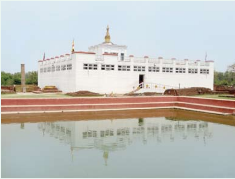
Mayadevi Temple and its pool