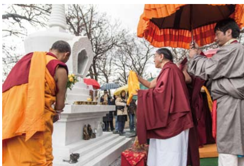
His Holiness inaugurating the stupa in Arosio