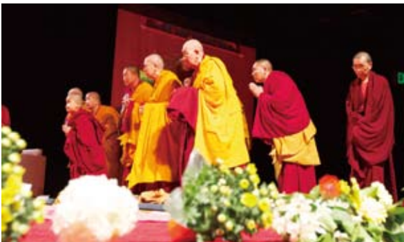
His Holiness bestows the precious Kalachakra in Minneapolis

the public. Upon his arrival a welcoming banquet was held in his honor, and then the following day was spent with sightseeing and a chance for individuals to meet with His Holiness privately.