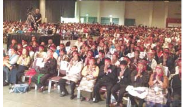
The Minneapolis sangha receiving the Kalachakra initiation