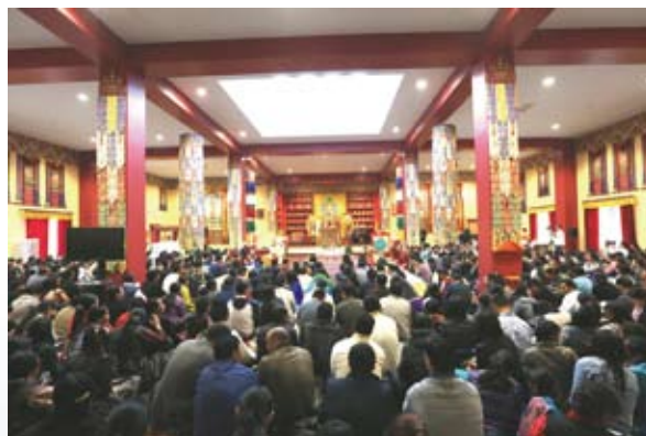
Many happy devotees fill the temple and its surrounding grounds

Inspired by His Holiness the Sakya Trizin's presence, many local Tibetan and Himalayan people from the New York and New Jersey areas came each day to see His Holiness and to receive His blessings and advice. On July 6, the Tibetan Community Association of New York and New Jersey sponsored a grand celebration of His Holiness the Dalai Lama's birthday at Tsechen Kunchab Ling, with His Holiness the Sakya Trizin as the main guest. Over 2,500 people participated in a day filled with traditional prayers, songs, and dances.