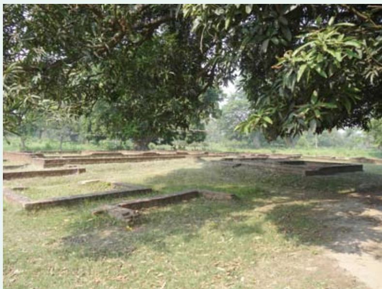
Ruins of the main palace at Kapilavastu