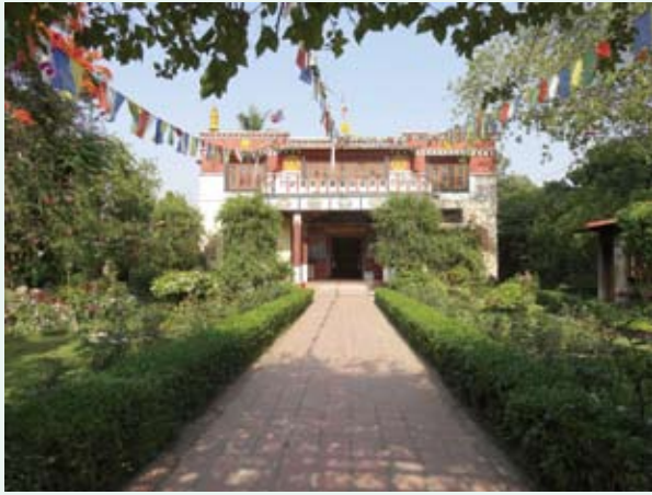
The old Tashi Rabten Ling and its sacred garden