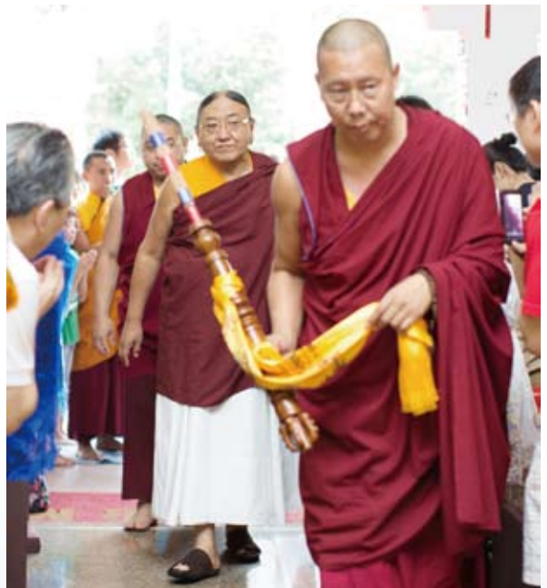
His Holiness arrives at Sakya Tenphel Ling

Singapore Sakya Centre's Executive Committee and devotees were most fortunate, honored and delighted to receive His Holiness, Gyalyum Chenmo