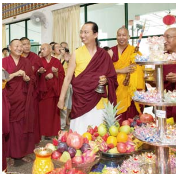
Bountiful offerings for the Ushnisha Vijaya Initiation