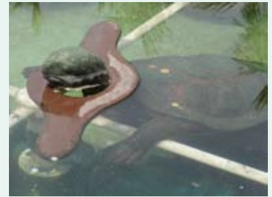
The Turtle and the Yoke at the German Temple

site centred on Buddhism. New temples are being built that are representative of their respective countries' branch of Buddhism. Although these are unanimously of great beauty, most of them don't harbour a monastic community and are not yet active centres of worship.