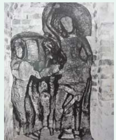
Bas-relief of the Buddha's birth