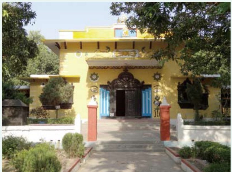
Rajakiya Buddha Vihar

Rajakiya Buddha Vihar as well as the Dharma Swami Buddhavihara and its sacred garden, a haven of beauty and serenity. Originally known as Tashi Rabten Ling, the Dharma Swami Buddhavihara was created in 1975 by His Eminence