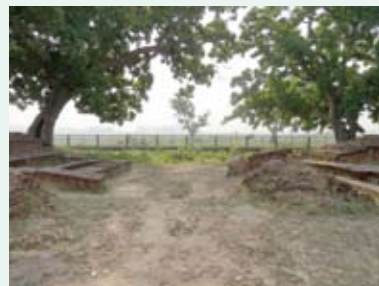
The Eastern Gate at Kapilavastu

And so, one night, while everyone was slumbering, He slipped away from the palace, crossing its eastern gate. Turning back, He swore not to return until He had attained the supreme accomplishment.