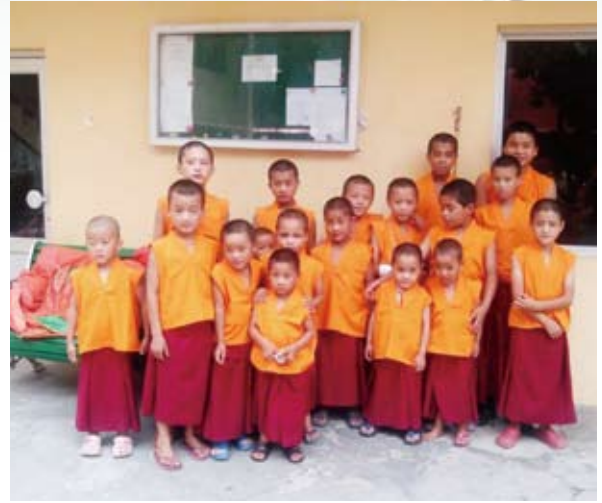
New members of the Sakya Centre