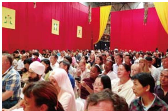
An international congregation in Los Angeles

His Holiness closed His American tour with a visit to the Los Angeles Sakya Centre, where He bestowed a Dharma talk on "The Nature of Mind" and the initiation and sadhana instruction on White Tara of the Six Light Rays.