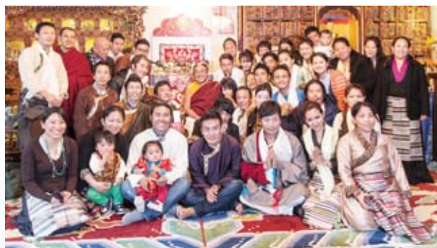
His Holiness with the Tibetan community at Thupten Changchub Ling