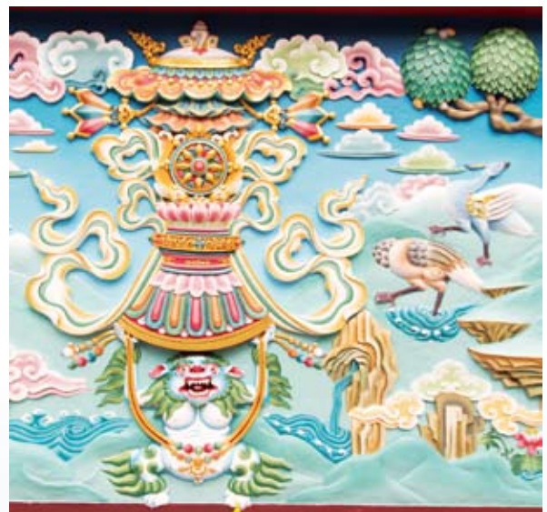
A new façade for the Centre

Himachal Pradesh denizens and pilgrims who had come to pray in its holy sites. The monks and nuns travelled to the affected area and distributed food and water to those in need and also held pujas on their behalf.