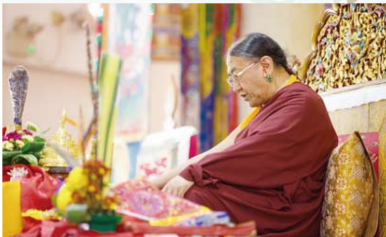
His Holiness graciously bestowing an initiation

There could be no greater blessing and auspiciousness than to have the holy presence of our most treasured Guru shortly after the Precious Lam Dre Tsog Shed's completion just a month before. Despite the tight schedule of four days, our most compassionate Guru not only bestowed a concise version of the rare Mahavairocana Yoga Tantra Empowerment,