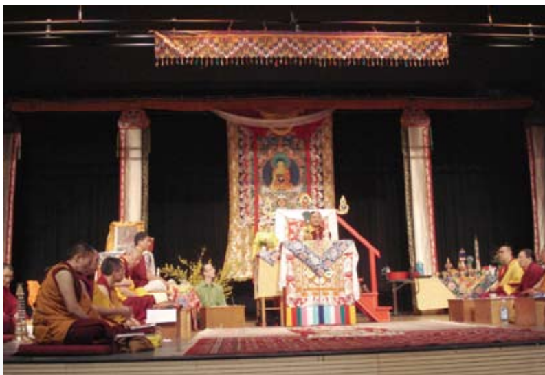
His Holiness at Dietikon

The last stage of His Holiness' European tour took place in Spain, and began with a visit to the Fundación Sakya in Pedreguer, where His Holiness imparted several teachings and initiations. His Holiness also visited the Sakya