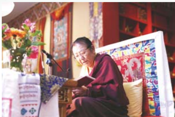
H.E. Jetsun Kushok bestows the Chenrezig empowerment