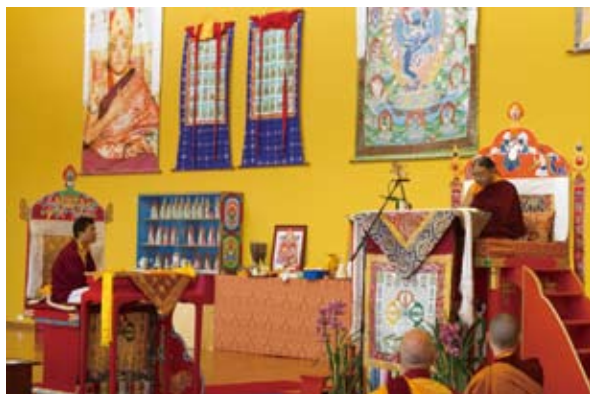
His Holiness teaching in Denia with Gyana Vajra Rinpoche

beautiful coastal landscape of Alicante, the Buddhist community of Pedreguer opened its doors and its heart to His Holiness the Sakya Trizin and to His younger son Khöndung Gyana Vajra Rinpoche.