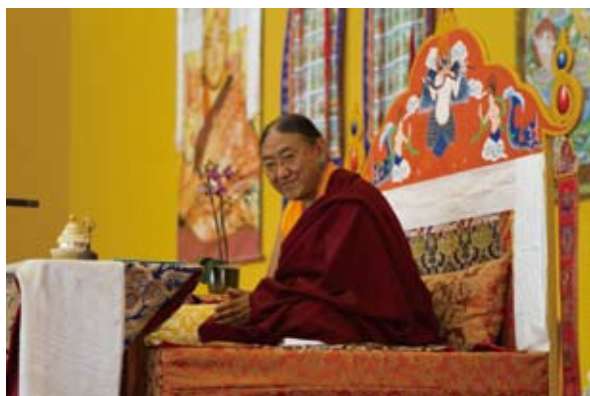
Kindness and wisdom in a smile

His Holiness began His teaching schedule with the bestowal of the pith instructions of the 'Parting from the Four Attachments' teaching and, over the course of the following days, blessed His students with the initiation of Chenrezig in the King's Tradition as well as a four-day initiation into the Four Directions deities of the Kadampa and a detailed commentary on their practice.