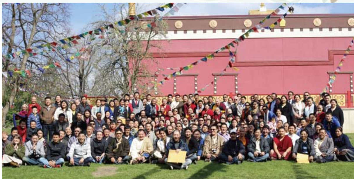
His Holiness with Sakya Tsechen Tsopa members at TKL

Mahasiddha Gorakshanath amongst others, as well as the Amitabha Phowa Transmission and a Changchog ritual to purify the karma of the deceased.