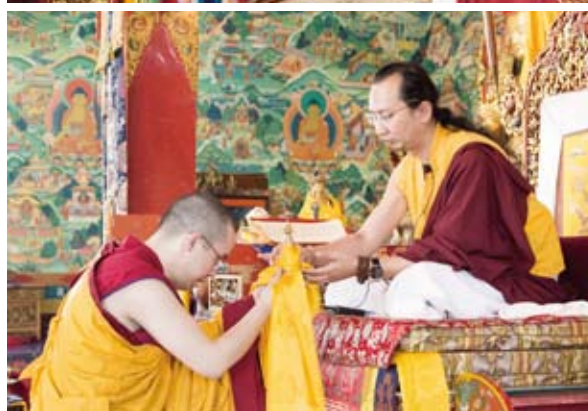
Their Eminences Tharig Rinpoche and Dezhung Rinpoche offering a mandala to Khöndung Ratna Vajra Rinpoche in their respective monasteries