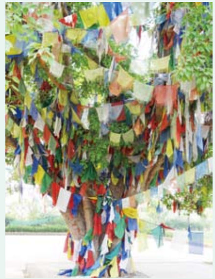
Tibetan flags at Mayadevi

the shrine, along with a bas-relief depicting the birth of the Buddha. The latter was sadly defaced by the invading Turks in the twelfth century.