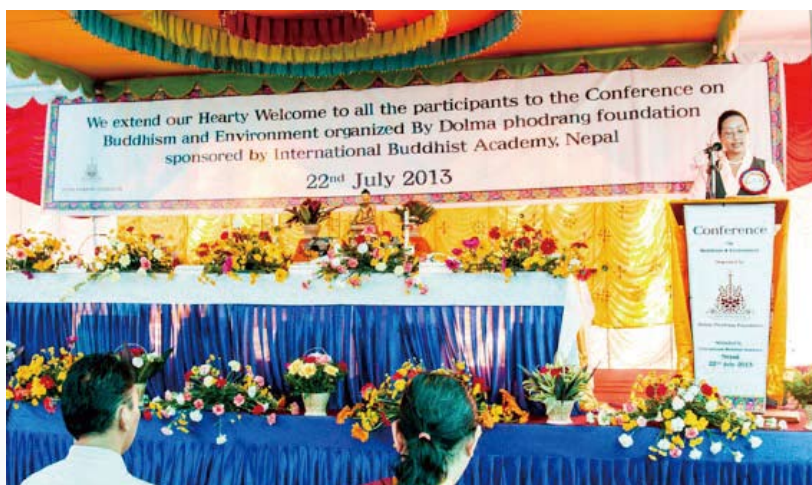
The 'Buddhism and Environment' Conference at IBA

With His Holiness the Sakya Trizin as its Patron and Khöndung Ratna Vajra Rinpoche as its Chairman, the Dolma Phodrang Foundation was created in early 2013 to carry out charitable works, enhance public consciousness of