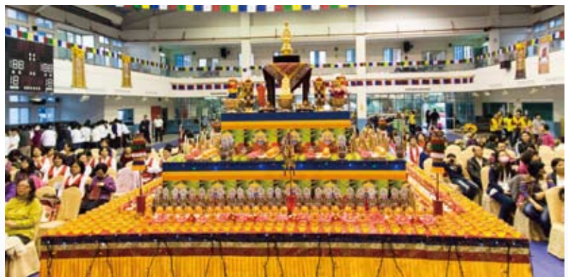
A thousand offerings to Namgyalma