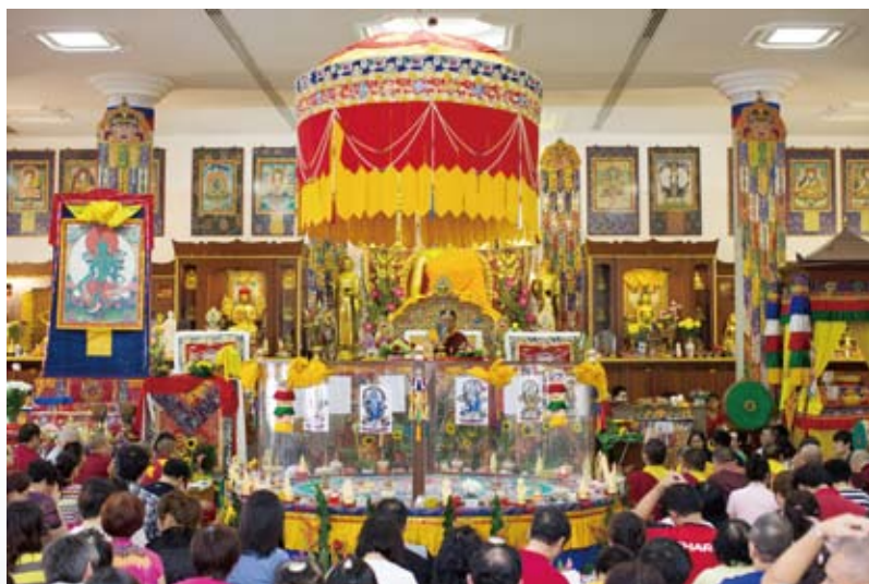
The precious Mahavairocana Sand Mandala

On the 12th of August, His Holiness and Her Eminence Gyalyum Chenmo left Singapore to return to their residence in India where, a few days later, His Holiness was to conduct the yearly Vajrakilaya Puja at the Sakya Centre in Rajpur, alongside Khöndung Ratna Vajra Rinpoche and Khöndung Gyana Vajra Rinpoche as well as the Phuntsok Phodrang Dungseys and several members of their respective families.