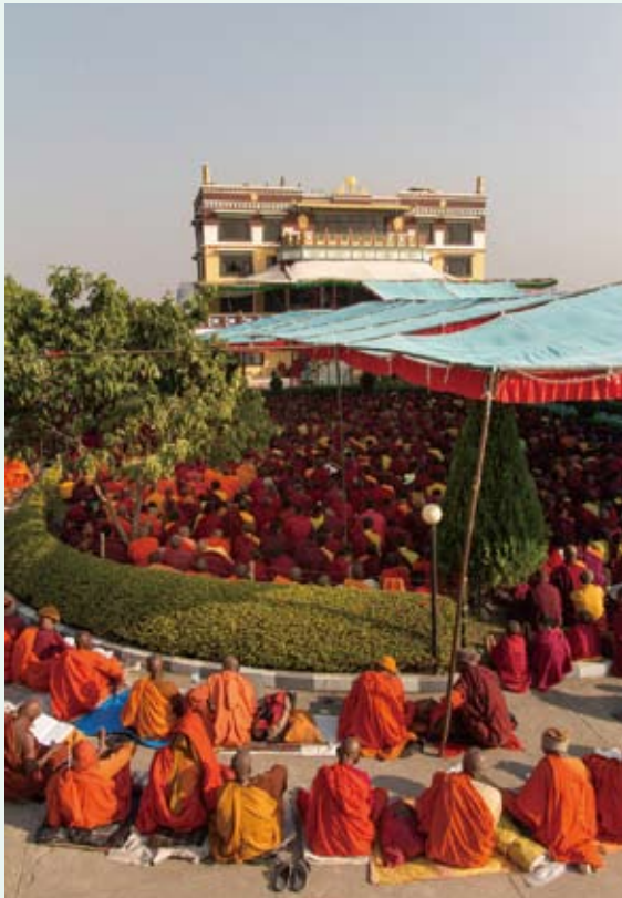
The new Tashi Rabten Ling

Sakya Mönlam Prayer Festival for World Peace, which is held each year in Lumbini and is generally conducted by His Holiness the Sakya Trizin, bringing together