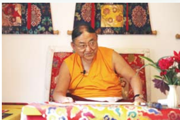
His Holiness bestowing private teachings by Chogyal Phagpa

flowers. In the afternoon, His Holiness bestowed the Thanthong Gyalpo long-life initiation to the happy crowd.