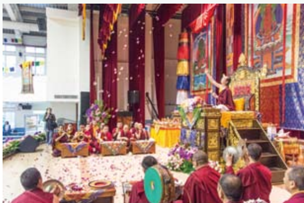
Bringing the Thousand Offering ceremony to an end

On the eve of his departure from Taiwan, it was