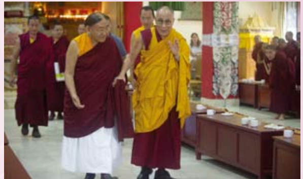
Arrival at Sakya Nunnery

On the 15th, His Holiness was welcomed at the Sakya Nunnery by His Holiness the Sakya Trizin and Khöndung Ratna Vajra Rinpoche. After spending the night there, His Holiness presided over a heated debate session conducted by students of the Sakya College for Nuns.