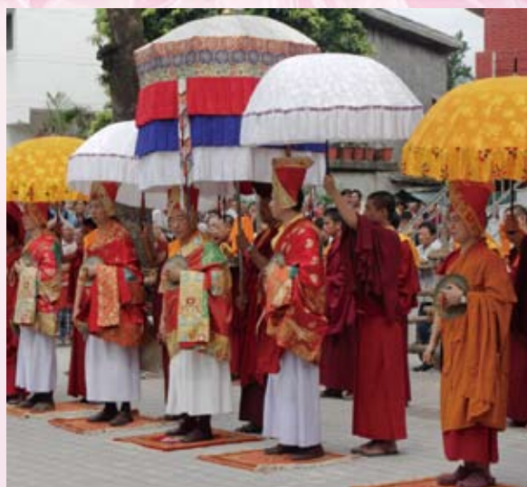
Part of the puja takes place in the temple courtyard

On the last day of the ritual, it is customary for the Tibetan community to throng the temple grounds. Most of the puja is held in the temple, but a section of it is held outside, and so the crowd needs to make