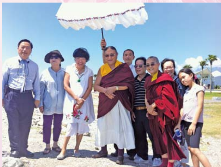
His Holiness and entourage enjoying the beach at Whalien

Then it was back to Taipei and to the next stop on His Holiness and Rinpoche's teaching tour. On 30th July, they left for Manila, in the Philippines.