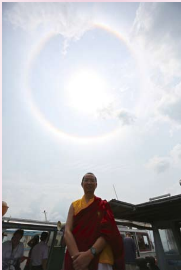
A blessing from the sky

boats at Changi Jetty and we headed for the deeper eastern waters to conduct our offerings and prayers. We anchored in the open sea and as soon as His Eminence and entourage started chanting some devotees spotted a faint round rainbow forming around the bright morning sun. As the puja progressed the round rainbow became more and more distinct with all the awe of its magnificent colours; indeed it was a once-in-a-lifetime experience for many of us, as sighting rainbows in Singapore is very rare, let alone a circular rainbow encompassing the sun. Everybody felt the presence of the Buddhas and the blessings being showered. What an extraordinary day it was. Rejoice!!! For many of us it was an unforgettable time being able to be with His Eminence out in the open sea to witness this Auspicious Naga Puja.