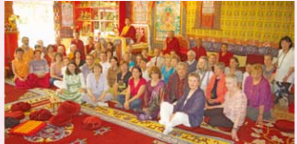
Rinpoche with the Sakya Tsechen Ling sangha

may we invite them all in our hearts and, as we sit in a sacred temple, may we embrace them in our practice, so that good health, happiness and peace can grow like the luminosity of the waxing moon."