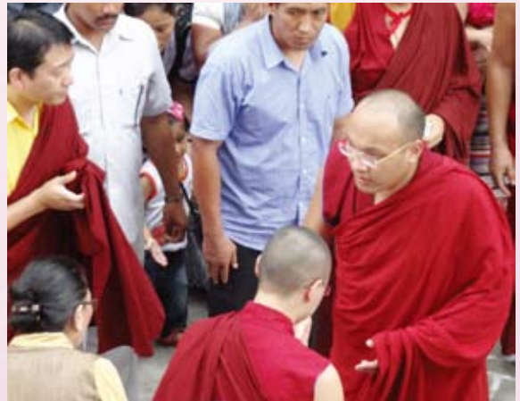
H.H. the Karmapa is bid farewell by Khöndung Gyana Vajra Rinpoche, H.E. Abhaya Rinpoche and H.E. Gyalyum Chenmo