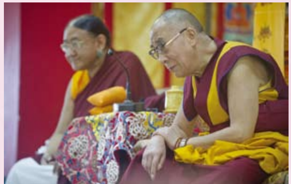
Watching the nuns debate