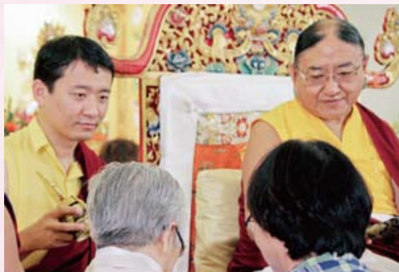
His Holiness bestowing the Kurukulle initiation

Dominated by large statues of the Buddha and vast