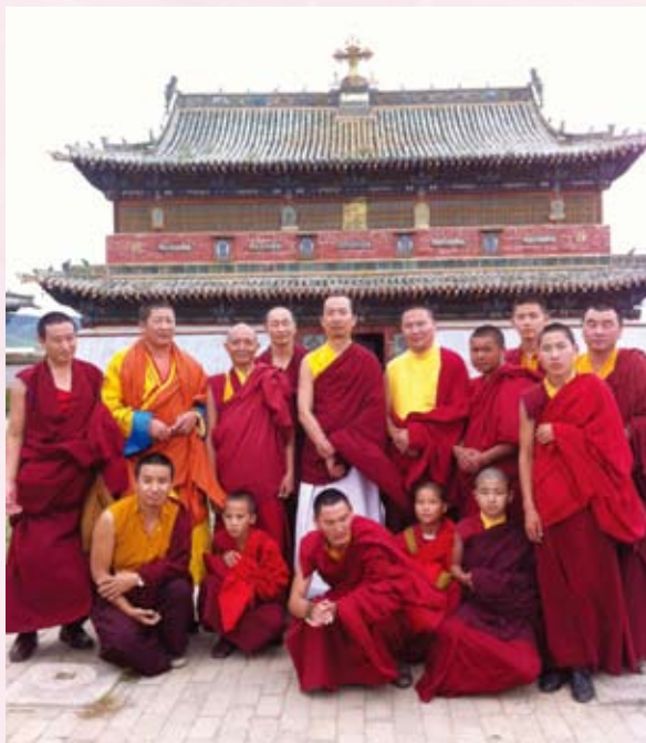
Rinpoche and monks at the inauguration of new temple in Kharkhorin

As His Holiness the Sakya Trizin and Ratna Vajra Rinpoche become increasingly involved in the renaissance of Tibetan Buddhism in Mongolia, the renewed presence of the Sakya tradition in the region invites us to draw a parallel with the pivotal role that their forebears played in sowing the seed of the Dharma in this fertile land and to pray that their activities may bring a bountiful harvest of fulfillment to a people that so thirsts for it.