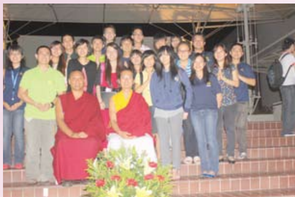
Rinpoche with the Singapore sangha

activities of our centre and participants. Subsequent activities included Sakya Pandita-Manjushri Guru Yoga Chin-lab and teachings, Sakya Nyung-nay text explanation to make aware the needs and benefits of this purification ritual retreat, and the 18-Jambhala Boom Drup, Water Offering and Tshok for the centre's Wealth Vase. On 22 August, His Eminence concluded His visit by giving an evening talk at Nanyang Technology University (NTU) Singapore on the invitation of the N.T.U. Buddhist Society.