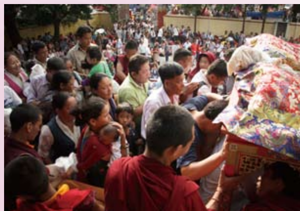
Devotees paying their respects to the Phurbas