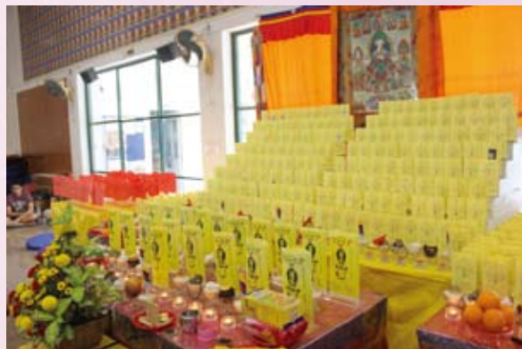
Changchok tablets for the ritual

Death is certain but the time of death is uncertain. Death comes to every one of us, and with it suffering, lamentations, grief and sorrow, and finally only memories. In this very present existence, we should not indulge in sadness and grief over the loss of our dear ones, but instead seek actively to bestow blessings on them for a better life. It is with this thought that the centre organized the Changchog for our members to create meritorious activities for their deceased loved ones, to help alleviate their dear ones to better rebirth and happiness."