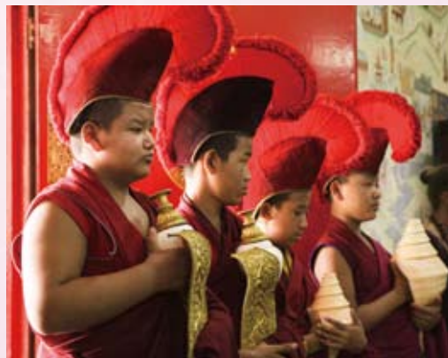
The music of Vajrakilaya