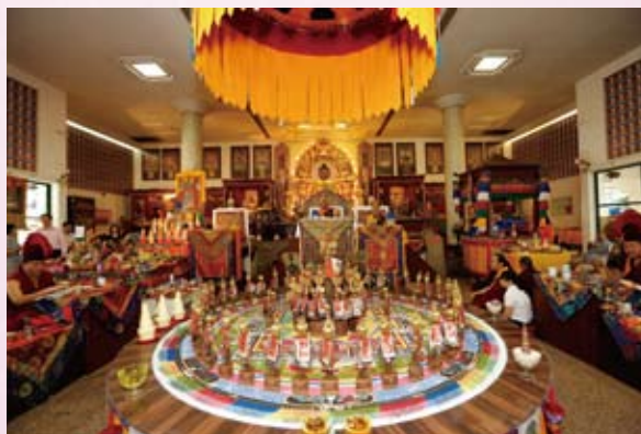
The Vajrakilaya mandala

This is very precious, as the teaching has continued through an unbroken lineage from the Primordial Buddha and has passed down through the Khön hereditary lineage.