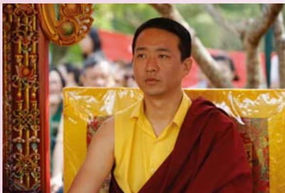
Khöndung Gyana Vajra Rinpoche