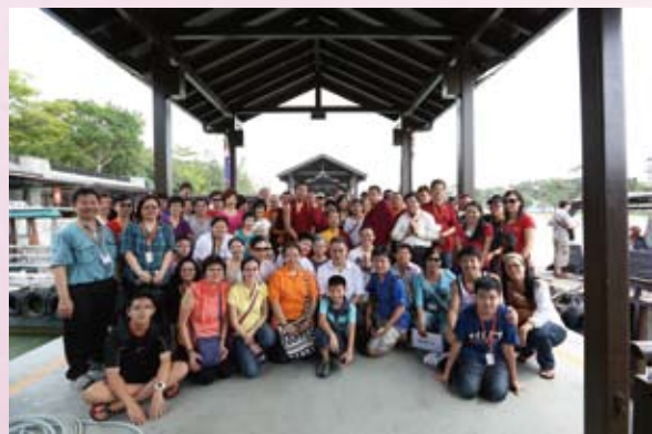
On the way to the Naga offering

Besides the above-planned programs, His Eminence also took time off to grace our centre's monthly Naga Puja held on the 18th of August. The Naga Puja started in our centre in the morning and the offerings to the Nagas were later done in the open sea. A total of about 80 devotees boarded 7