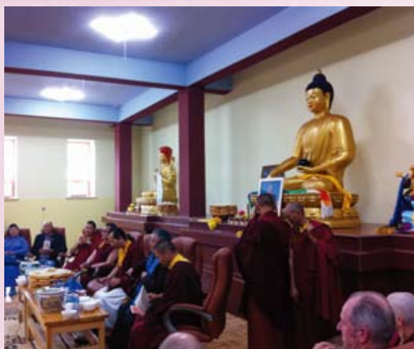
Rinpoche inaugurating the Sakya Pandita Dharma Chakra Monastery in Ulaanbaatar

And so it remained until the 20th century, when religious practice was suppressed by the ruling communist government, resulting in the number of Buddhist monastics dropping from 100,000 to little over 100. The fall of communism in 1991 allowed Buddhism to thrive anew in the country, leading it to once again becoming the predominant religion.