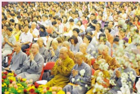
Students from many different traditions attended the teachings