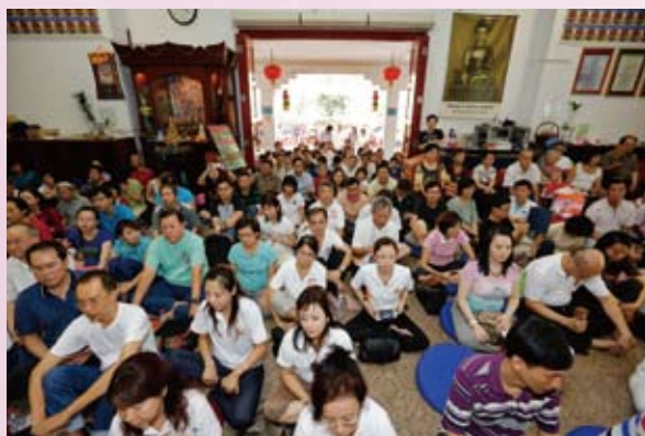
Hundreds of students attended the empowerment

His Holiness then concluded His Singapore trip by giving the Hevajra Path Empowerment on 11th June before His departure on the 12th of June for Taipei to continue the next leg of His teaching tour in Asia. Rejoice, rejoice!!"