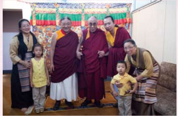
H.H. the Dalai Lama with H.H. the Sakya Trizin and family

His Holiness then visited the Sakya Centre, where He was presented with a mandala offering by His Holiness the Sakya Trizin. He also gave a short talk on the importance of deepening the meaning of the Dharma.