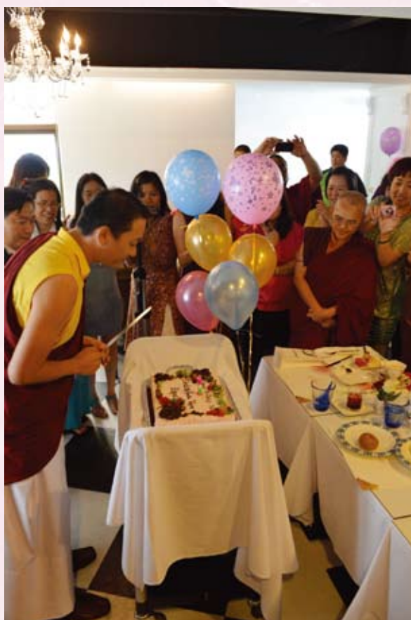
Gyana Vajra Rinpoche at his birthday celebration

Although essentially Chinese in its overwhelming majority, the group that attended the teachings had an eclectic makeup to it, crossing social, cultural, religious and national boundaries. The occasion was not only blessed by the presence of His Holiness and His family, but also by that of eminent masters