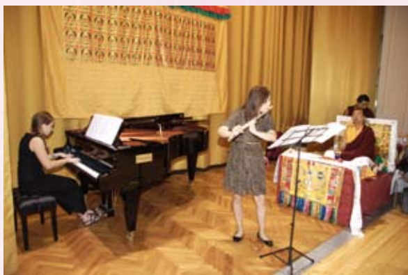
In gratitude, Rinpoche was offered a musical performance at the conclusion of the teaching.