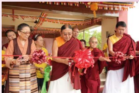
Ribbon-cutting ceremony at Sakya Osel Ling in Kapit

And so, on 23rd August, the 2012 East Asia Teaching Tour of His Holiness the Sakya Trizin and Khöndung Gyana Vajra Rinpoche came to a conclusion, as they and their entourage flew back to Delhi and then on to the Sakya Dolma Phodrang in Dehradun on time to celebrate the Annual Vajrakilaya Puja at the Sakya Centre.