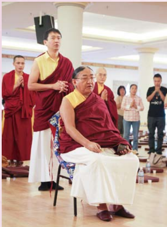
Inauguration of the new centre

His Holiness and Gyana Vajra Rinpoche arrived in Kuala Lumpur on the 9th of August. They had been invited by the Hai Tao Foundation to inaugurate the Foundation's new Sakya Centre as well as to impart various teachings and empowerments over the space of the following six days. The Foundation is committed to a Rime approach to Buddhism and invites teachers from various different traditions to share their wisdom with its members.