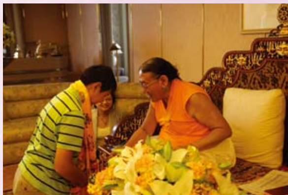
His Holiness tending to disciples in His reception room

And so, His Holiness' Dharma activities in Taiwan were ceaseless - His Holiness only had one day's rest over the whole of His stay in Taiwan. Visits to other centres, teachings and initiations kept His Holiness tied to a constant labour of love.