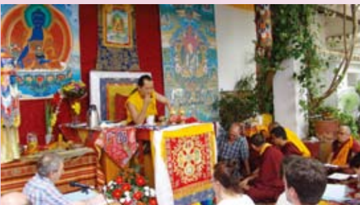
Rinpoche at Sakya Drogon Ling

high number of participants, the event was held in the beautiful and charming Chamarel Hotel, a 19th century manor house, which lent to the occasion a beautiful and intimate touch. In spite of the teachings lasting only two days, everyone kept commenting on how extraordinary it was, how magical and wonderful, and how at certain moments one could actually feel as