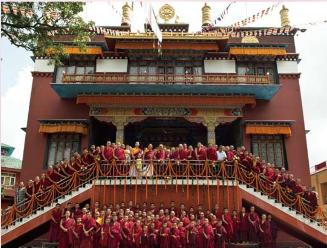
Group photo at the Sakya Centre

His Holiness the Dalai Lama then left for Mussoorie, where He spent the two following days visiting schools and other institutions before returning to Dharamsala.