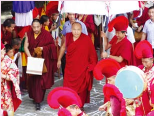
H.H. Gyalwang Karmapa arrives at the Sakya Centre