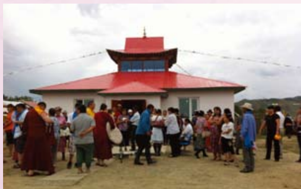
Rinpoche inaugurating the new temple at Khor Horon

And so it remained until the 20th century, when religious practice was suppressed by the ruling communist government, resulting in the number of Buddhist monastics dropping from 100,000 to little over 100. The fall of communism in 1991 allowed Buddhism to thrive anew in the country, leading it to once again becoming the predominant religion.