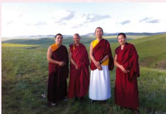
Rinpoche and attendants on their way to Darkhan

Covered by steppes, Mongolia is the most sparsely populated country in the world, with nomads forming a substantial part of its population. And so, as Rinpoche visited centres scattered across the land, he had the occasion to appreciate the nomadic way of life and admire the majestic Mongolian landscape.