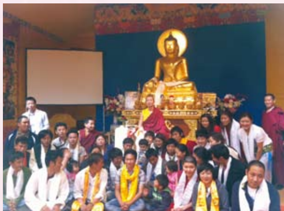
Rinpoche with the Paris Sangha

Rinpoche then travelled to Paris, where he spent a weekend at the Rigpa Centre near Paris, giving initiations. He also gave a public talk on 'How to practice and find internal peace in our modern world.'