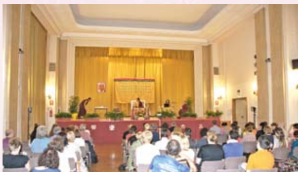
Rinpoche addressing the audience at the Conference